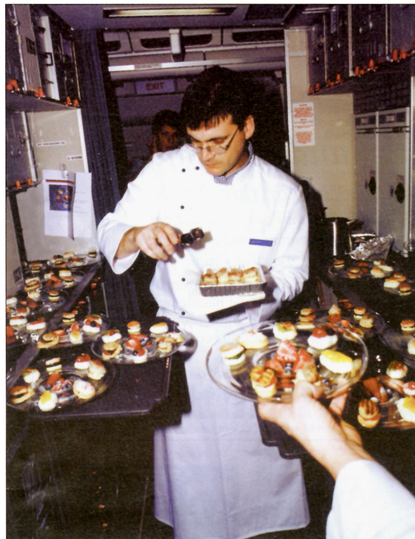
A qualified chef is carried on board each flight to prepare your orders

midland's long-haul flights will be able to choose between three classes of travel - 'the business' (24 seats); an enhanced economy product labeled 'the new economy' (48 seats) and the 'economy' cabin (with 172 seats). Each of the 244 seats has its own in flight screen monitor with a wide selection of channels available. Amongst the most popular on this flight were the live transmissions from the forward looking camera along with spectacular views from the vertical mapping one. Alternatively you could watch the flight's routing being traced on the screen, along with readouts of altitude, ground speed and elapsed time. And to think, back in the mid-