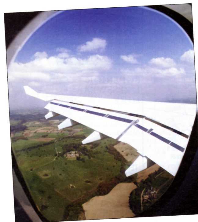
Lined up for an approach to 06 Right, bmi's A330-200 passes over the stately home and grounds of Tatton Park, Cheshire