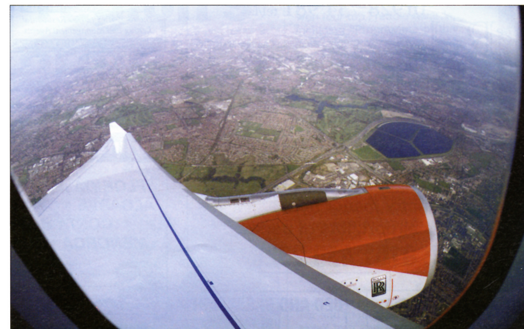
The City of Manchester is spread across the picture: conspicuous by its size is the water reservoir at Audenshaw, with the newly opened eastern stretch of the M60 running alongside

The twin-engine A330 combines some of the lowest operating costs of any aircraft ever designed. The revenue earning efficiency of the A330 is further enhanced by the voluminous underfloor cargo holds, with room for up to 60 per cent more freight than a Boeing 747. The unrivaled operating economics of the A330 mean that an aircraft can even operate profitable cargo flights without a single passenger on board, as demonstrated by some airlines which have flown regional overnight freight-only services with the A330, after a full day's passenger service.