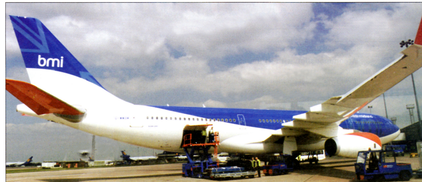
bmi's new A330-200 prepares for its next flight

trols to access the wide variety of films on offer, each carefully selected to get you in the mood, depending on whether your flight is heading for the US or the UK. There are also up-to-the minute television news channels and a multitude of games, but if you just want to sit back and relax you can tune into dozens of carefully selected audio channels catering for all tastes in music, talk shows and