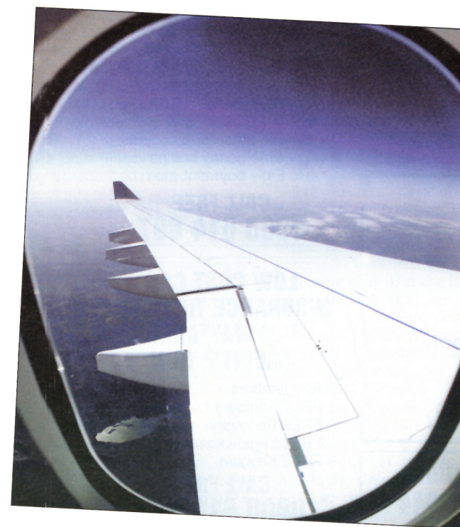
Made in Britain: the A330 wings are manufactured by BAE Systems at their Broughton factory near Chester. In the distance is the snow capped peak of Ben Nevis