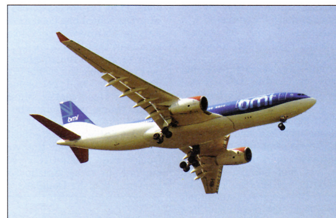
Prior to the launch of the transatlantic routes, the first bmi A330-200 operated a series of flights on the airline's Manchester to Heathrow shuttle, much to the surprise and delight of the passengers

A Manchester investment bmi british midland has invested £10 million in arrivals, departure lounges, passenger connection links, additional staff and check-in facilities, which the airline sees as a significant contribution to the overall growth of Manchester Airport. It is anticipated that the launch of services from Manchester to the US by bmi british midland will contribute substantially to the