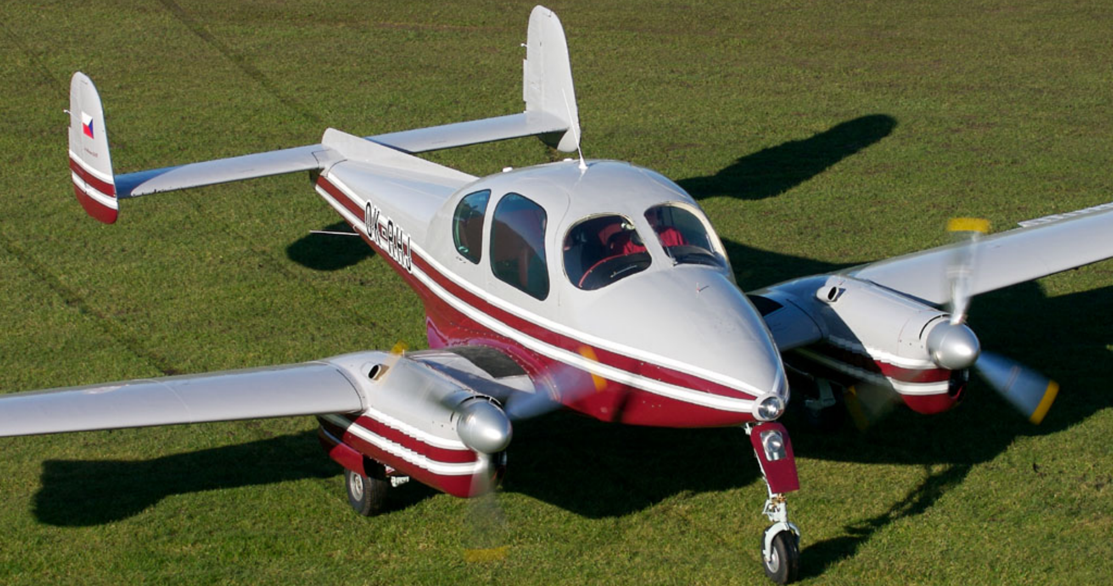
Pictured on a visit to Manchester-Barton from its base on the Isle of Man, L-200A Morava OK-RHJ : February 9, 2006.