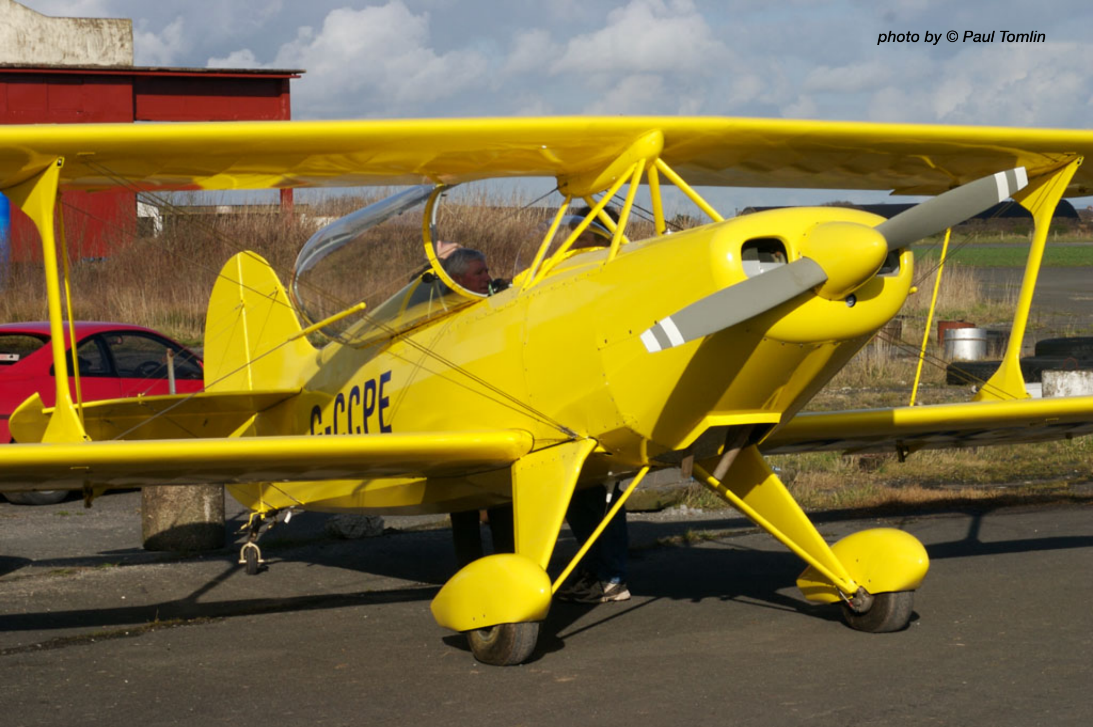
Newly built Steen Skybolt, G-CCPE, about to make its first flight, Kirkbride : February 18, 2006