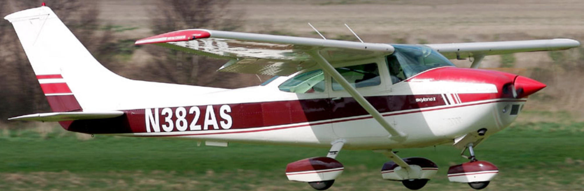
Cessna 182 N382AS was also based at Barton for several years, seen departing Barton : March 26, 2005