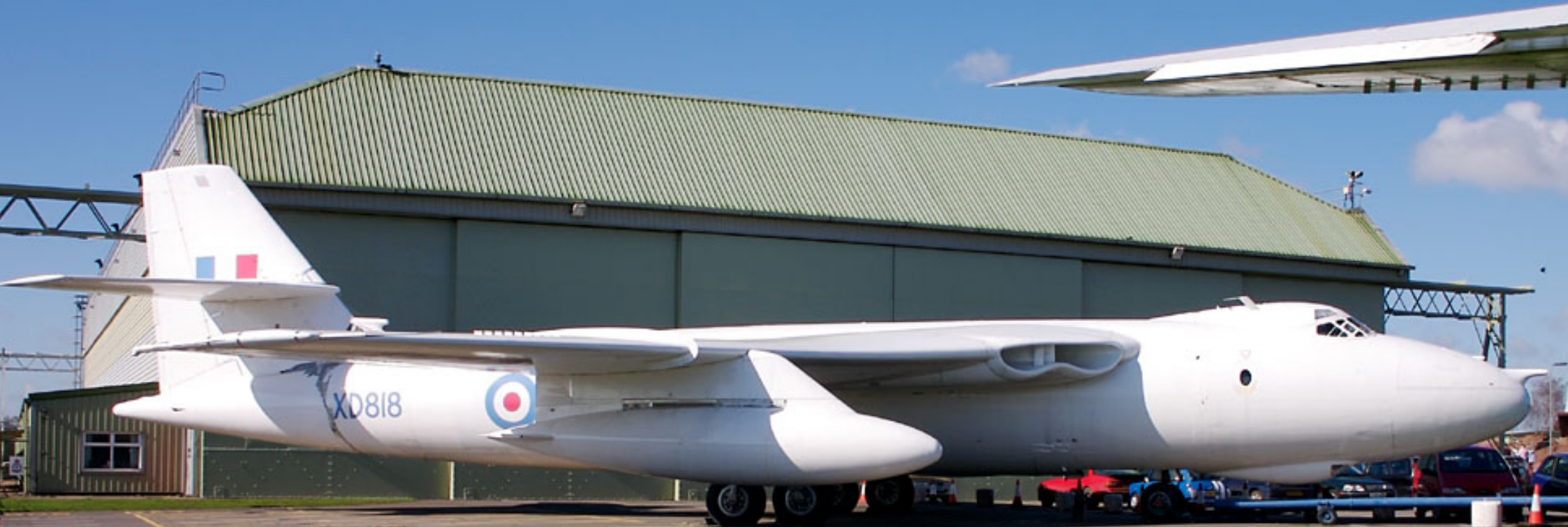
Vickers Valiant, XD818, at the RAF Museum, Cosford : April 5, 2006