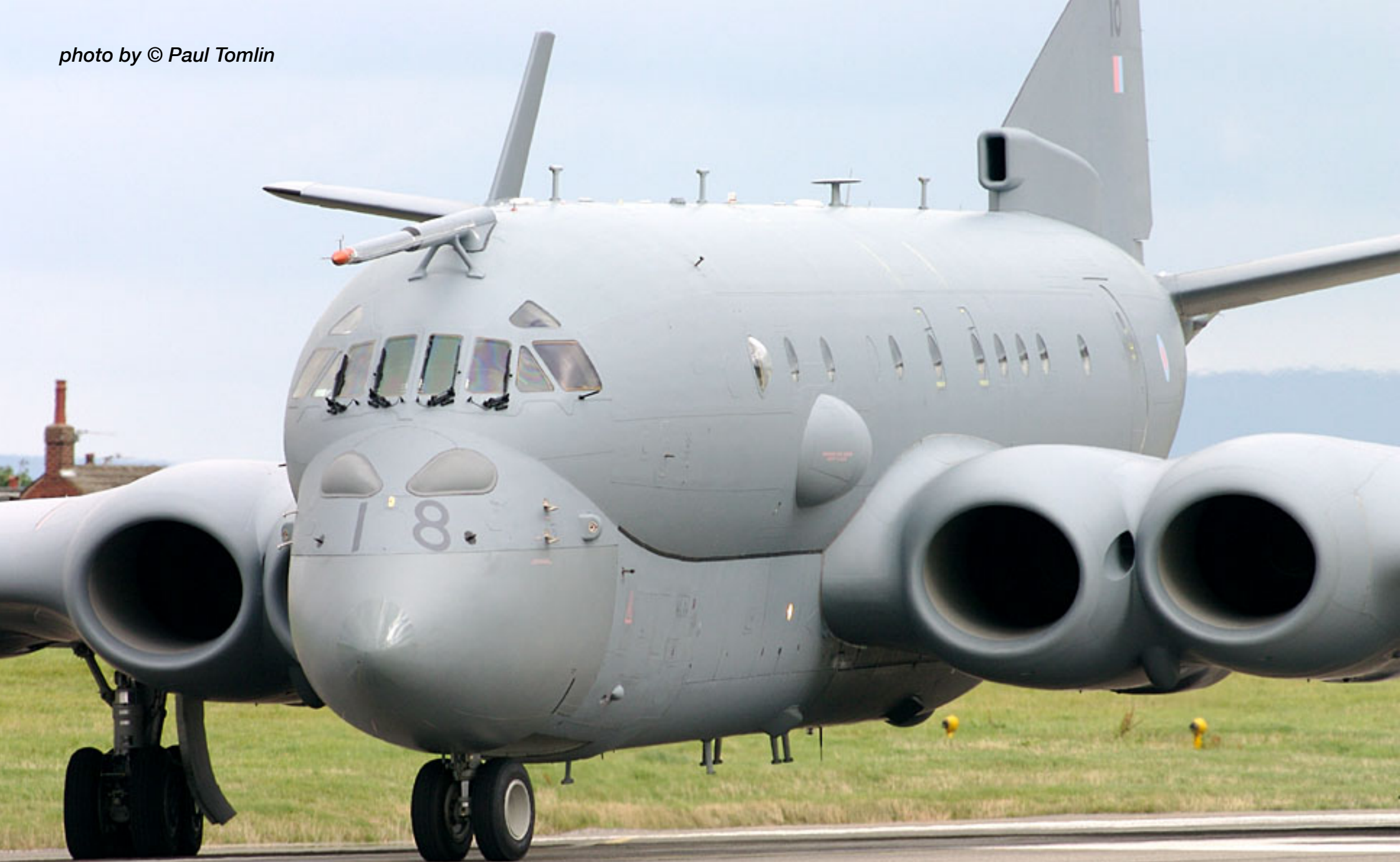
ZJ518 (PA-02) Nimrod MRA.4 test flying at BAE Warton : September 13, 2005.