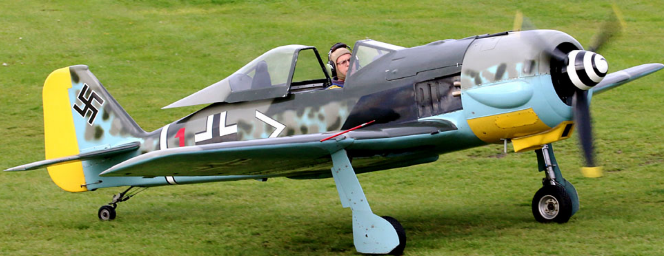
Scaled Focke-Wulf FW190, G-WULF, completes its third test flight following a 6-year restoration, Manchester-Barton : October 3, 2022