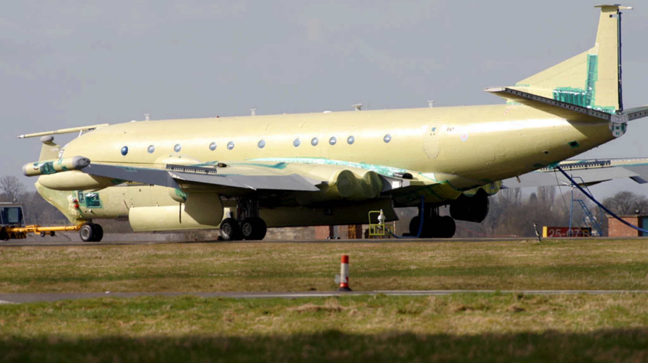
Seen outside for the first time, Nimrod MRA.4, ZJ520 (PA-07) on hull pressure testing, Woodford : March 27, 2010