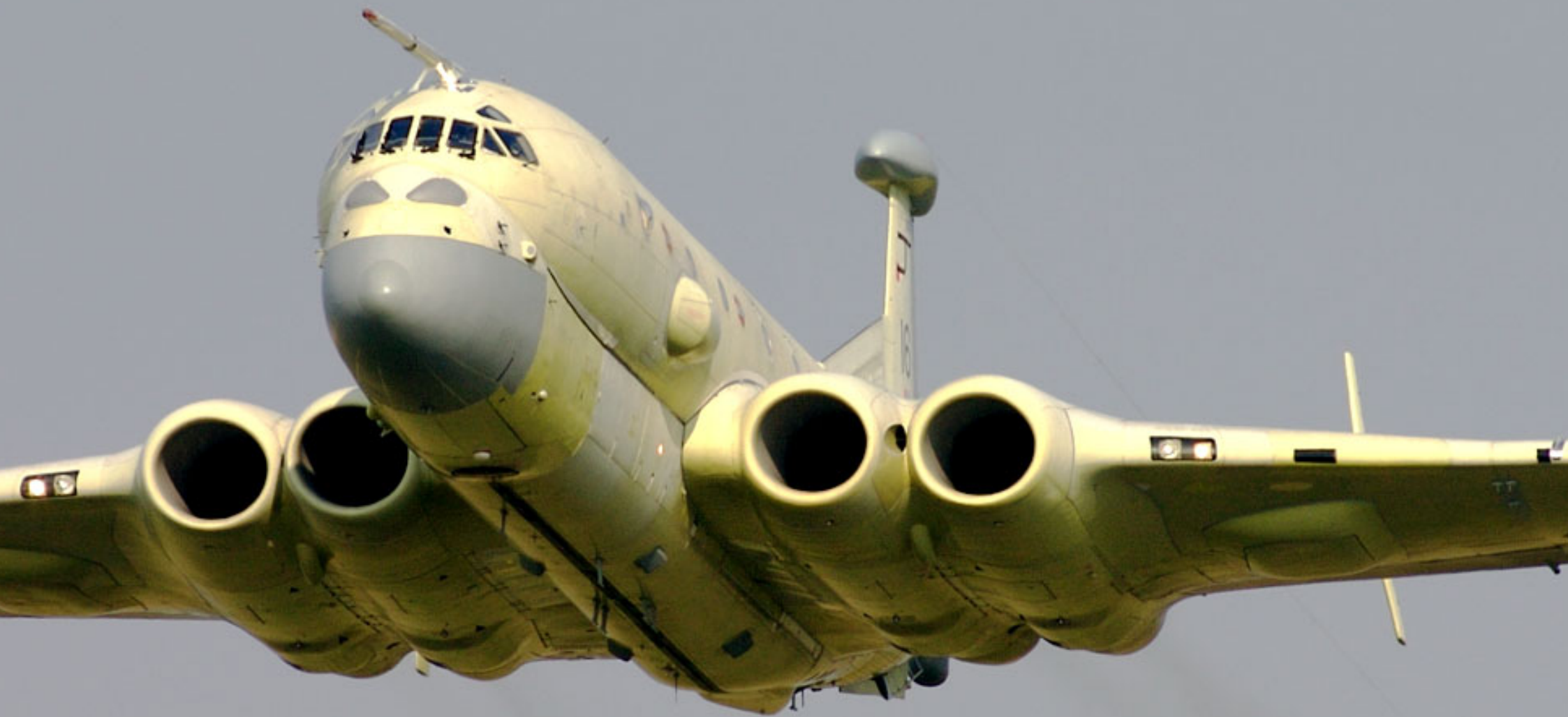
ZJ516 (PA-01) Nimrod MRA.4 trailing orange static cone, during air speed calibration tests at Warton : September 22, 2005.