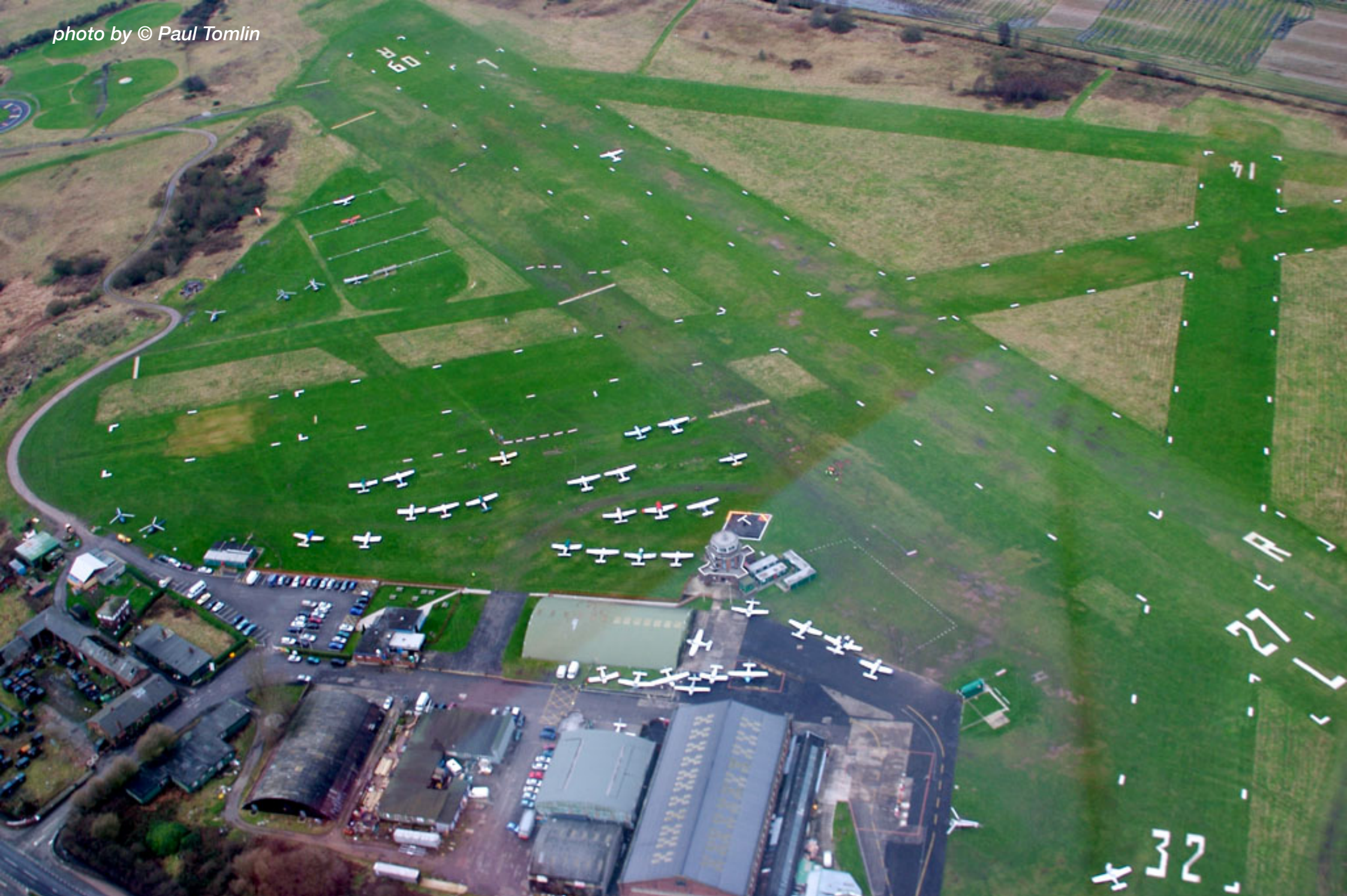
Completing its test flight, Ikarus C42, G-CDBU, returns to Barton for a landing on Runway 27 Left : January 19, 2005