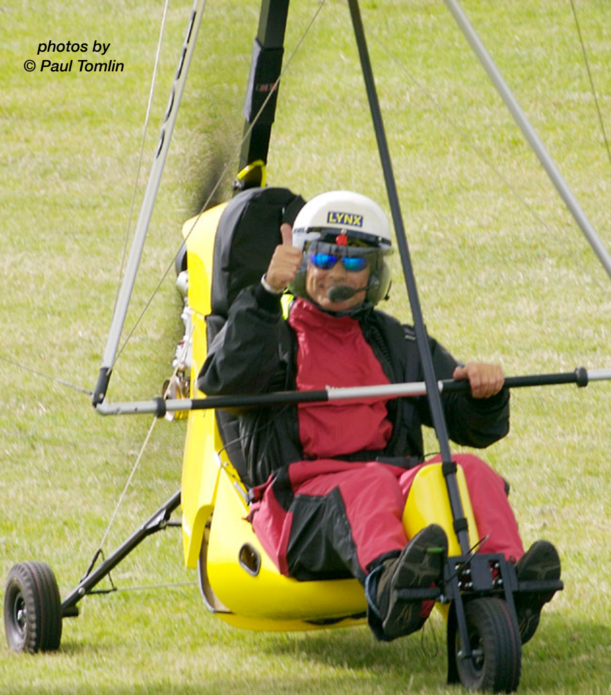
Flylight Airsports Dragonfly G-CFXK, Manchester - Barton : July 11, 2009