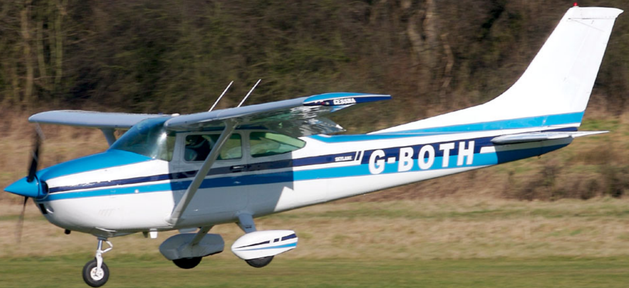
Cessna 182 G-BOTH, was another long-standing Barton resident seen landing : February 9, 2006