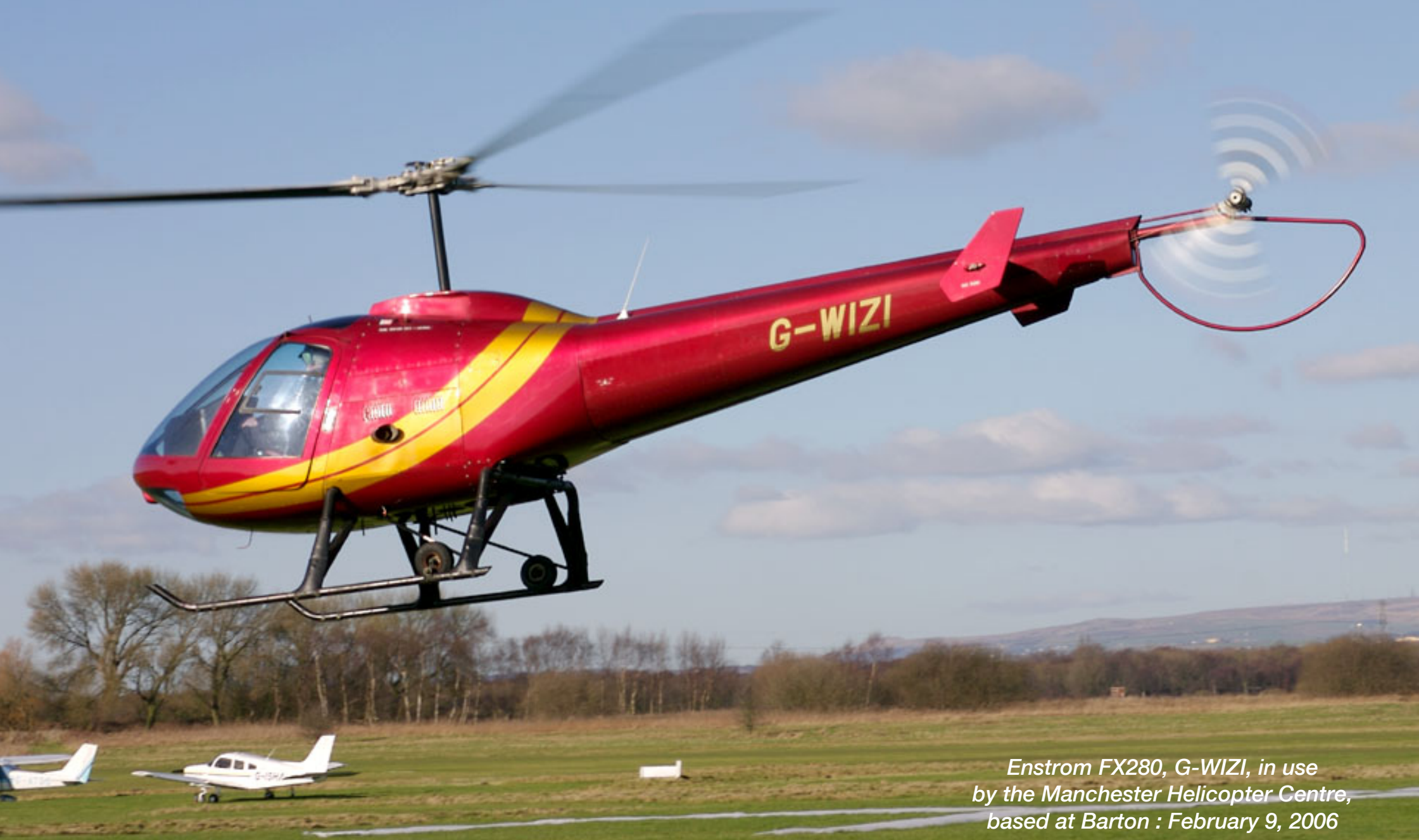
Enstrom FX280, G-WIZI, in use by the Manchester Helicopter Centre, based at Barton : February 9, 2006