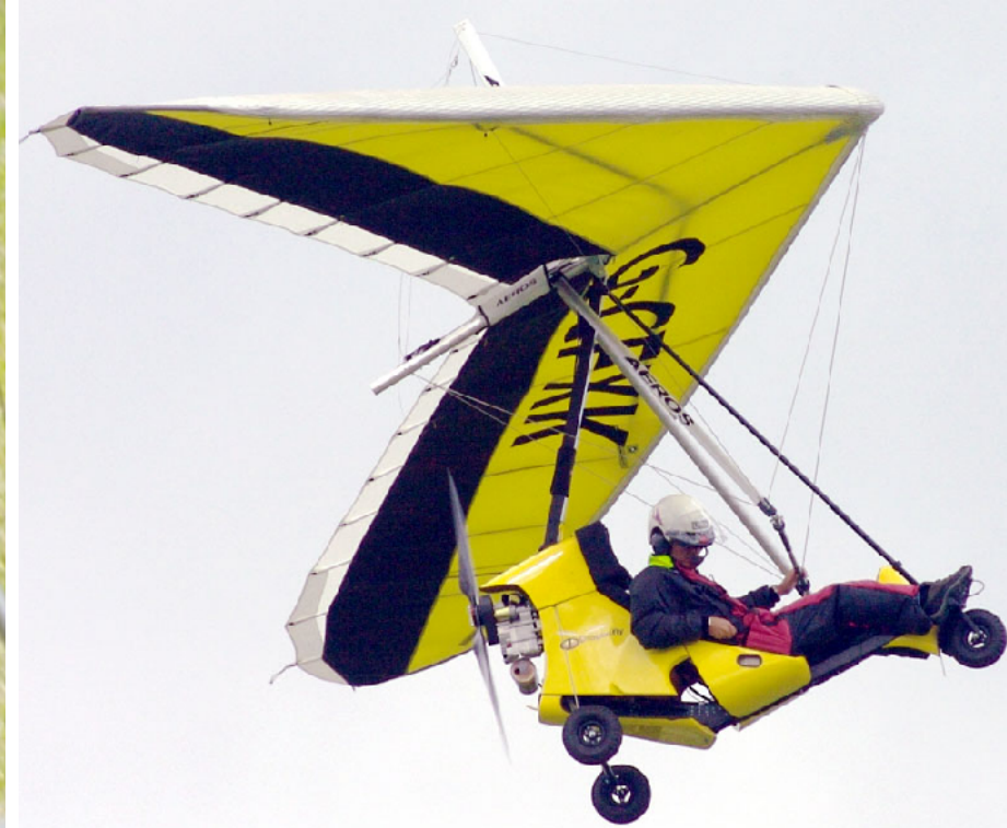
Thumbs Up from test pilot Marcus Furniss !