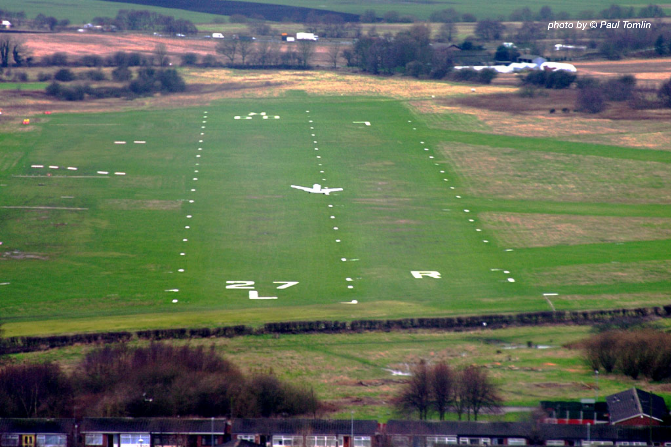
Viewed from Ikarus C42 G-CDBU following behind PA-28 G-LACA for Runway 27 Left at Manchester-Barton : January 19, 2005