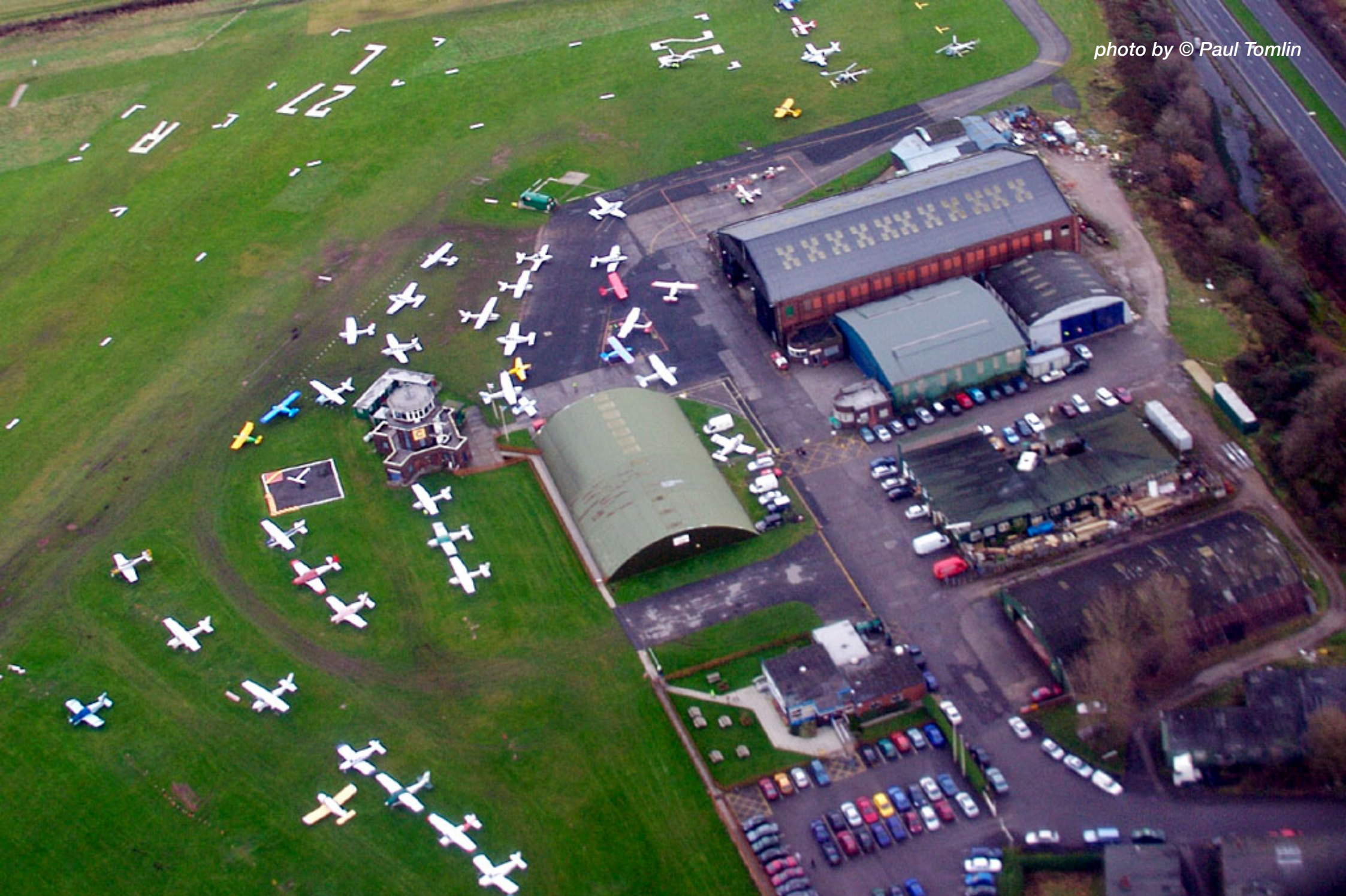
Overhead view from Piper PA-22 Tri-Pacer, G-AREV, Manchester-Barton : December 4, 2004