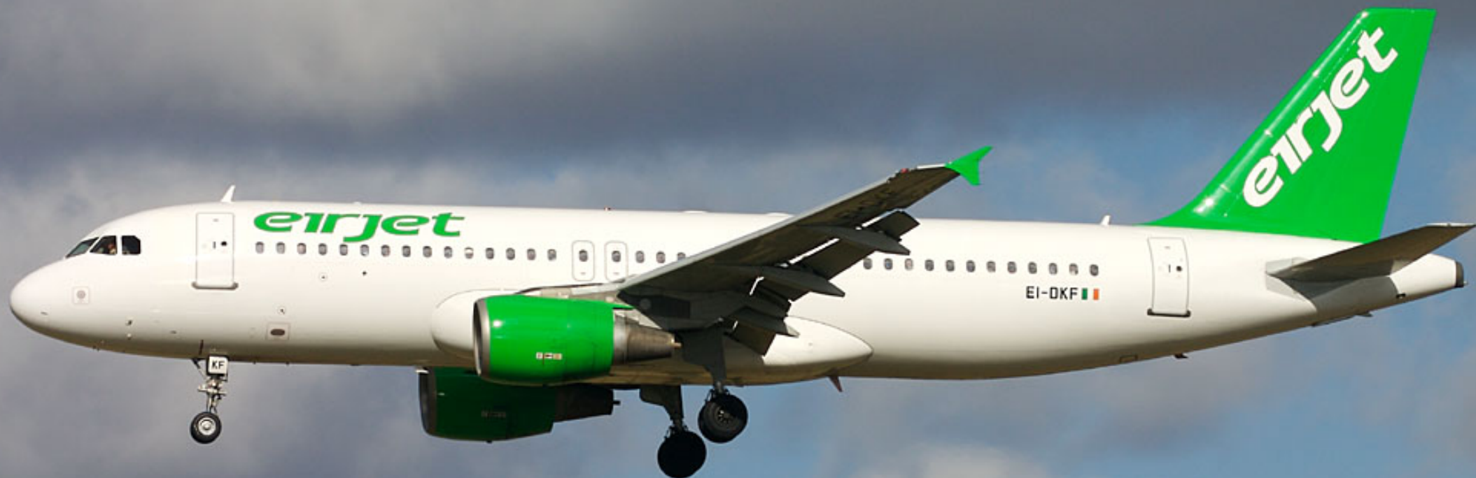
Eirjet Airbus A320, EI-DKF operating a Ryanair flight, Liverpool : March 1, 2006.