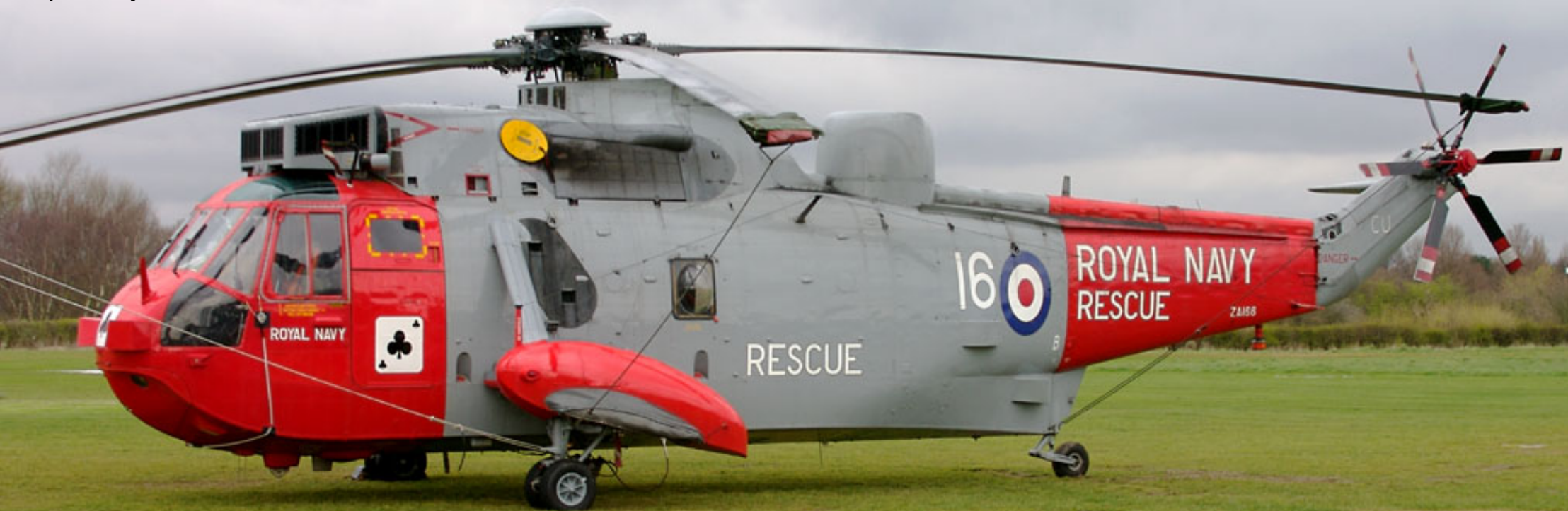
ZA166 Sea King Manchester-Barton : March 29, 2007