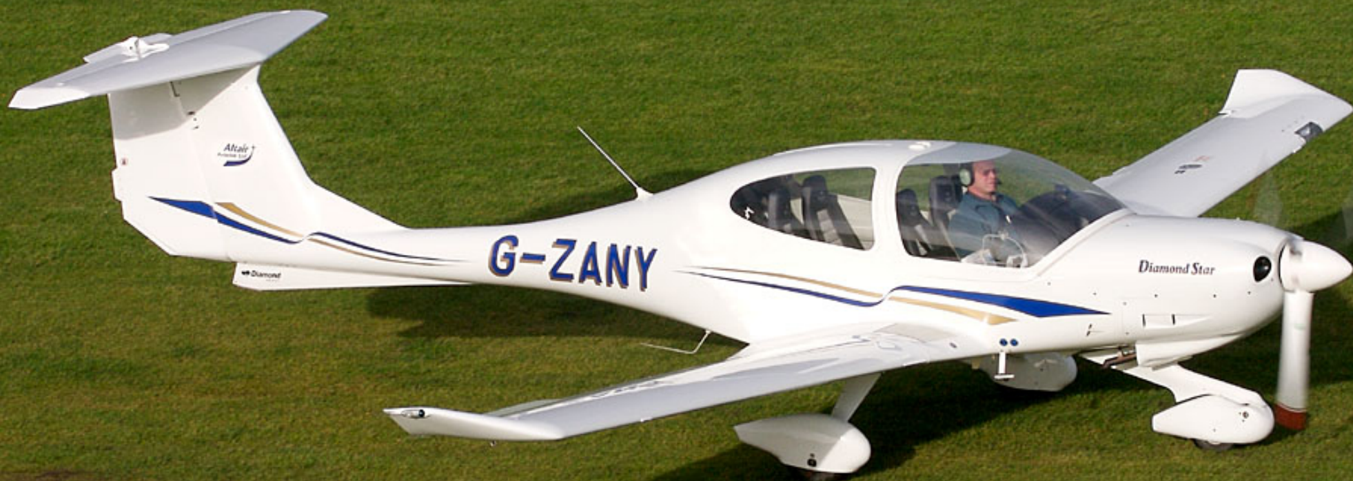
Theilert diesel engine powered Diamond Star DA-40D, G-ZANY, arrives Manchester-Barton : January 13, 2005.