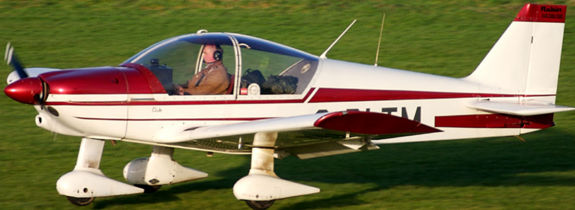
Barton-based Robin HR200/100, G-BLTM, touches down at Manchester-Barton : January 13, 2005