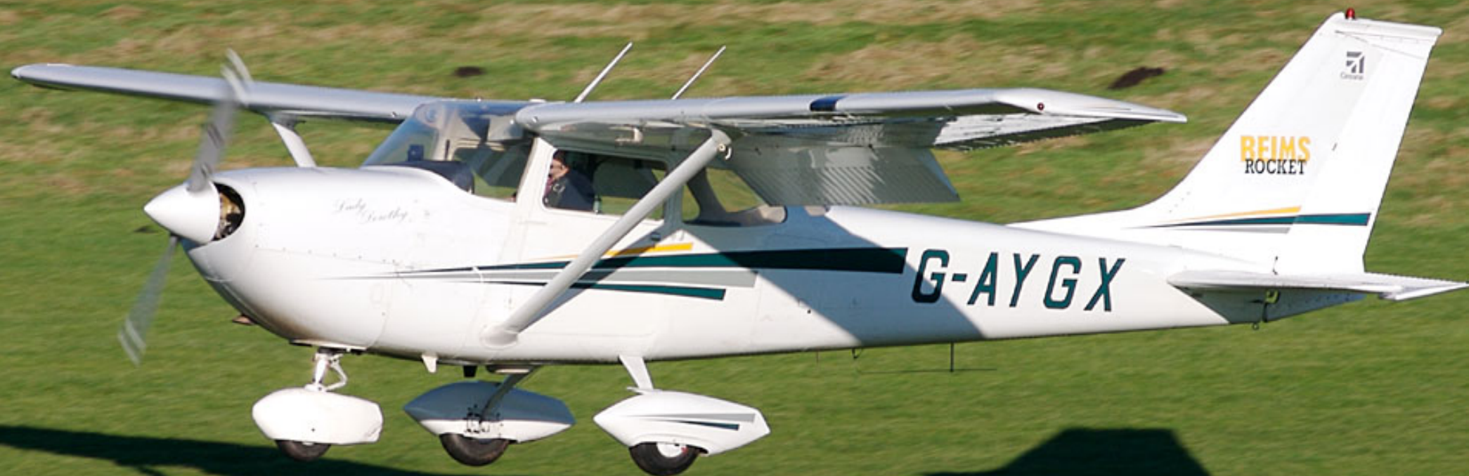
Barton-based Cessna FR172G Reims Rocket, G-AYGX, touching down at Manchester-Barton : January 23, 2005