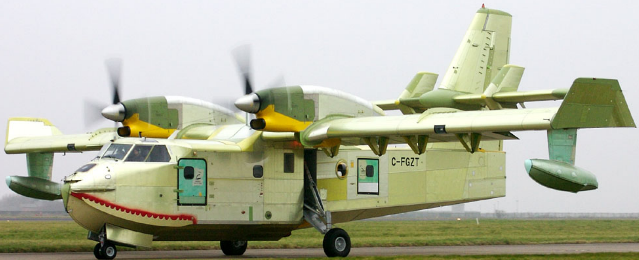
Liverpool : February 2, 2006, Bombardier CL-415 amphibian, C-FGZT, taxis out for departure to Marseille on its delivery flight from Canada to the French Protection Civile, having arrived LPL the previous day from Reykjavik.