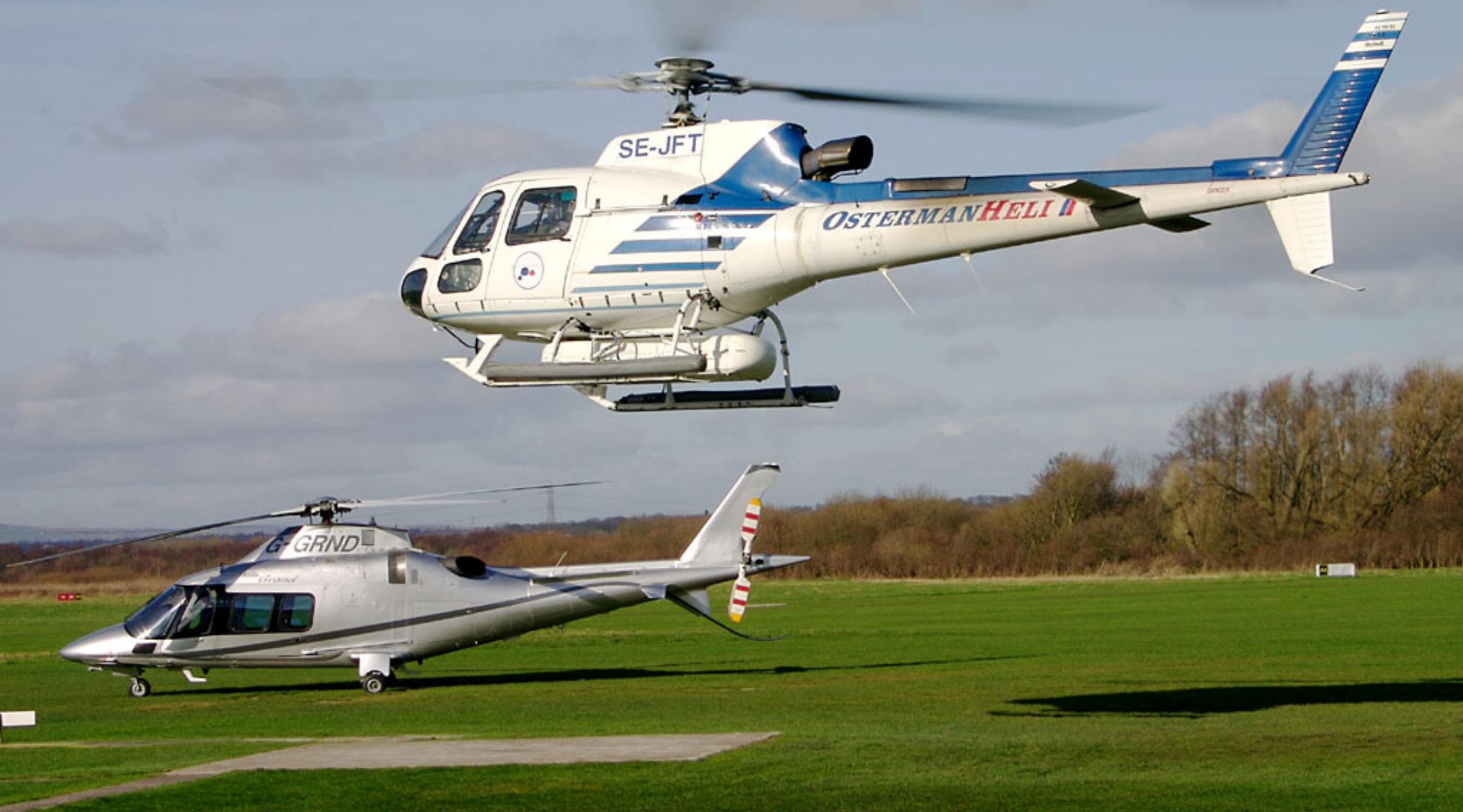
LIDAR equipped AS350, SE-JFT, was based at Barton flying local survey work for new rail tracks : February 26, 2007.