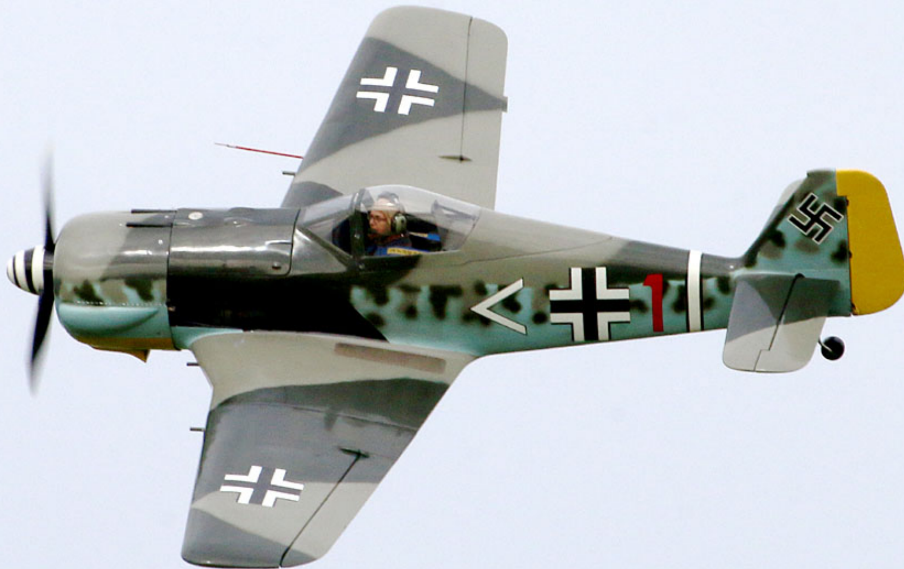
Scaled Focke-Wulf FW190, G-WULF, airborne on its third flight after a 6-year restoration, Manchester-Barton : October 3, 2022