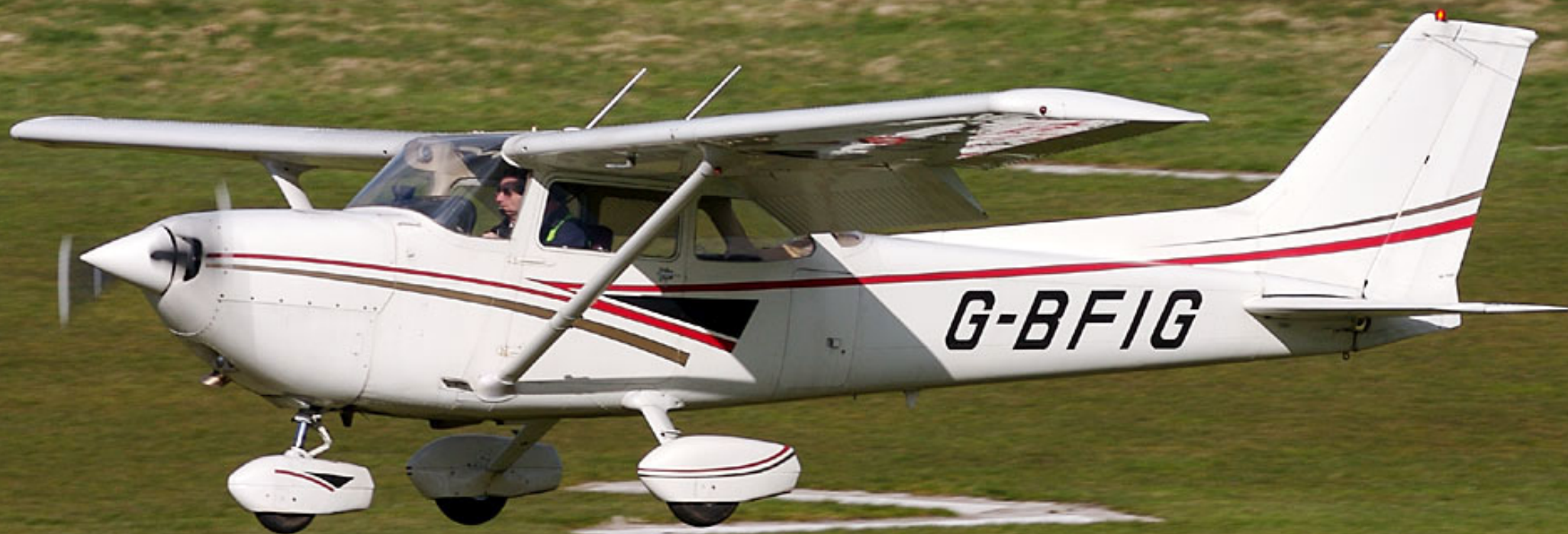
Barton-based Reims Cessna FR172K, G-BFIG, arrives Manchester-Barton : March 12, 2005