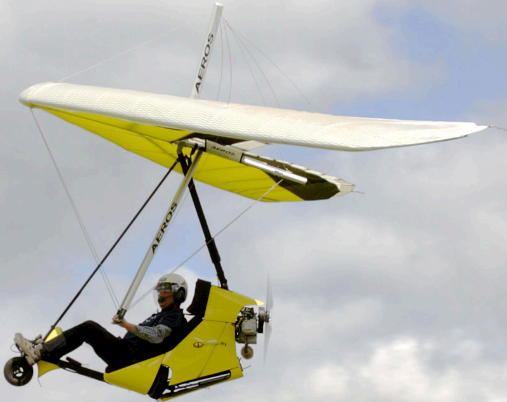
With main undercarriage retracted, Flylight Airsports Dragonfly, G-CFXK, departs Kenyon Hall : May 1, 2010