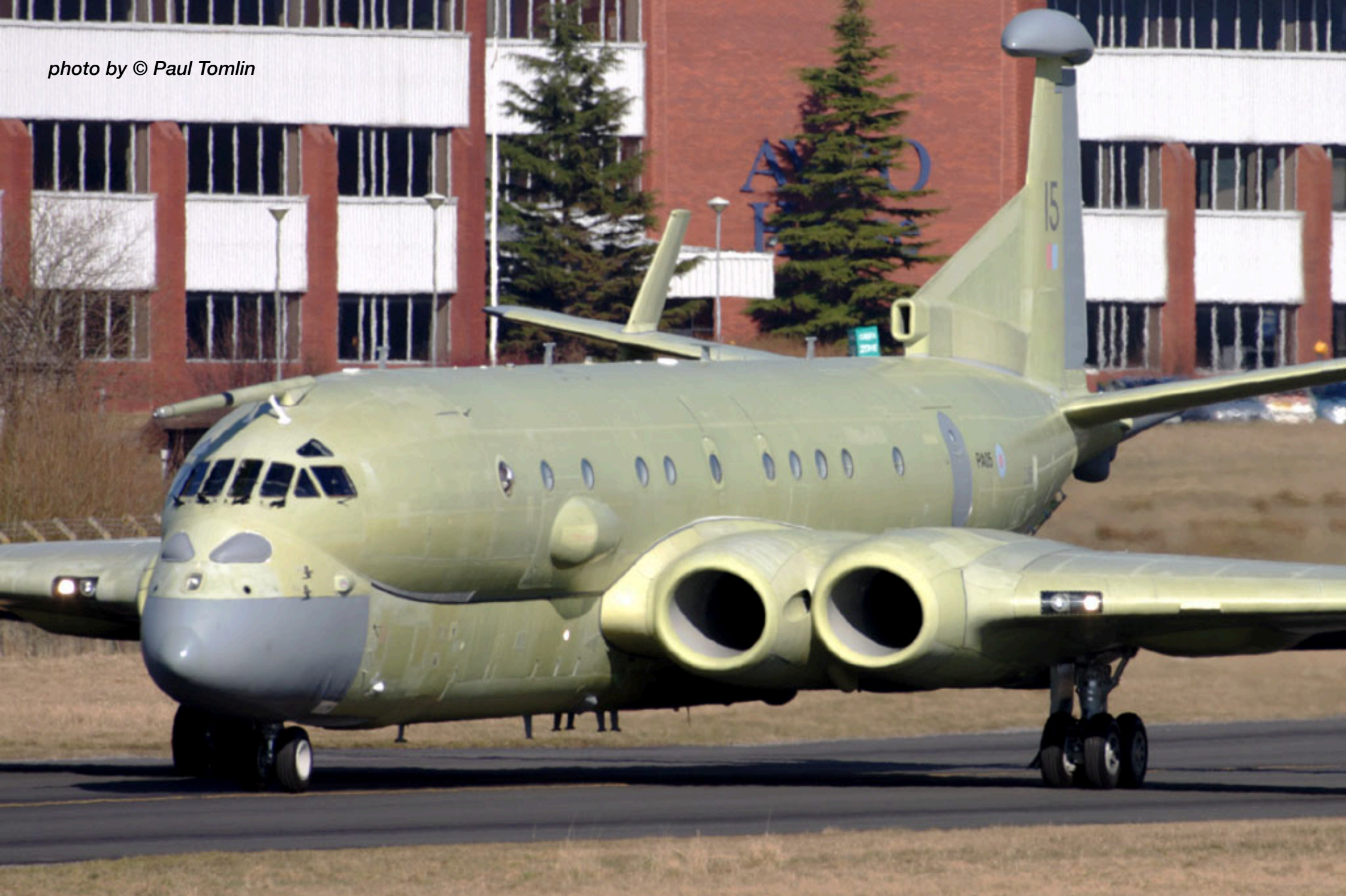
Taxiing out to make its first flight, which ended at MAN (for painting) - Nimrod MRA.4, ZJ515 (PA-05), Woodford : March 8, 2010.